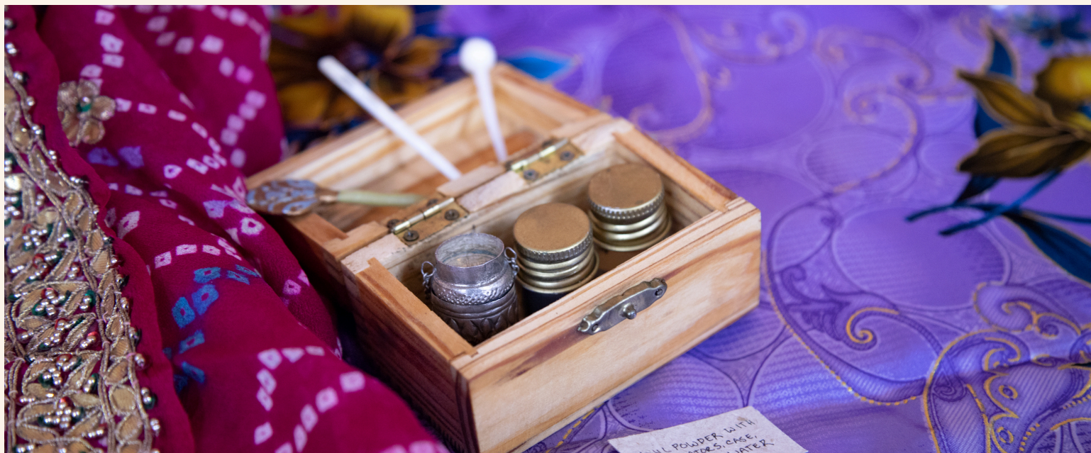
Art: Historical Make up by Noble Rinn