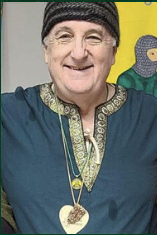
Lord Roderick Mund