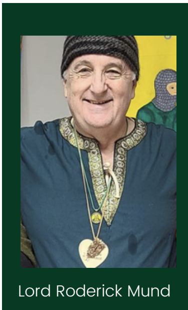
Lord Roderick Mund